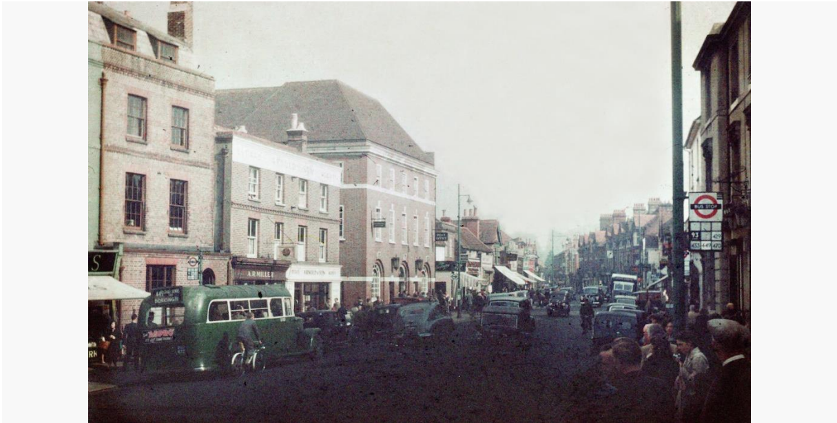
High Street Dorking in 1952.