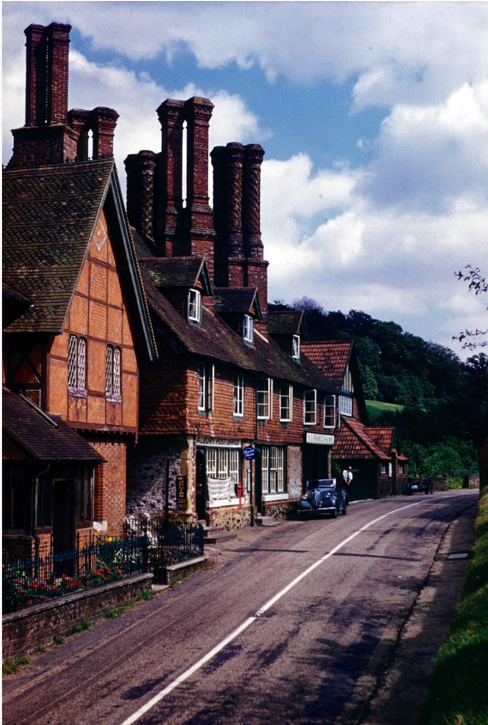
Cottages in Albury with their characteristic 'Pugin' chimneys. The photo dates to 1952. Note the post office with its red wall letterbox and advertising sign for Players cigarettes.