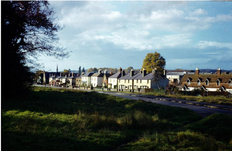
A view of the A248 Kings Road, Shalford, from 1951. Between the cottages on the right, the roofs of the Nelco factory in Station Road can be seen.