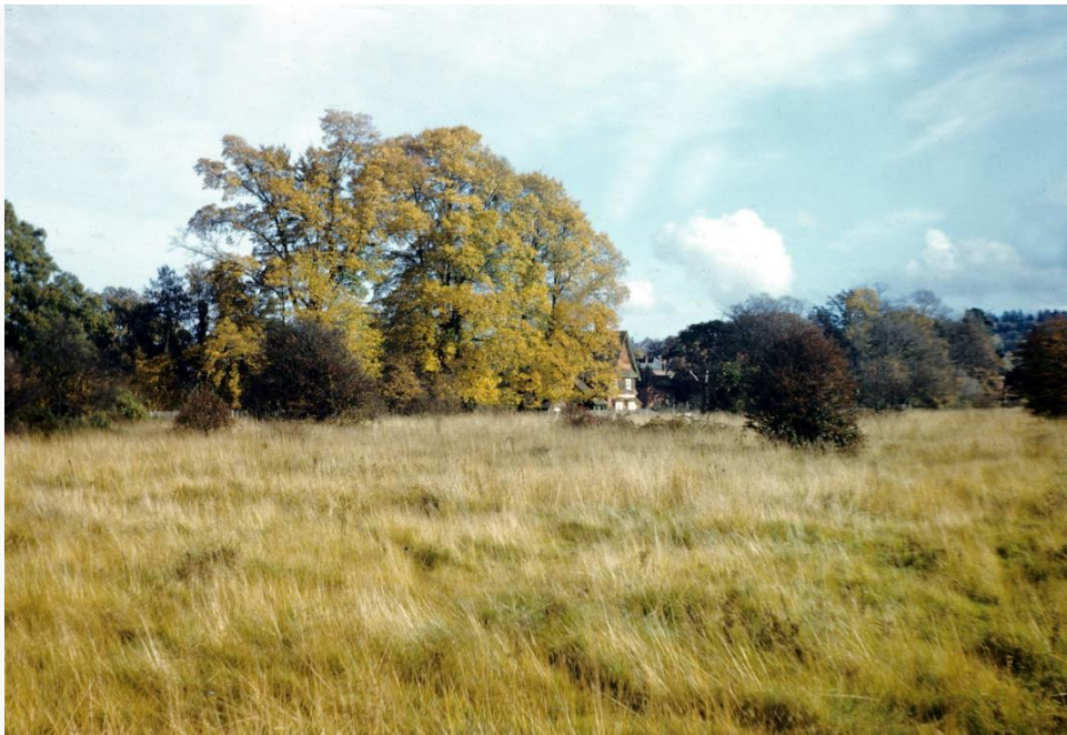
Elm trees on the common at Shalford in 1951.