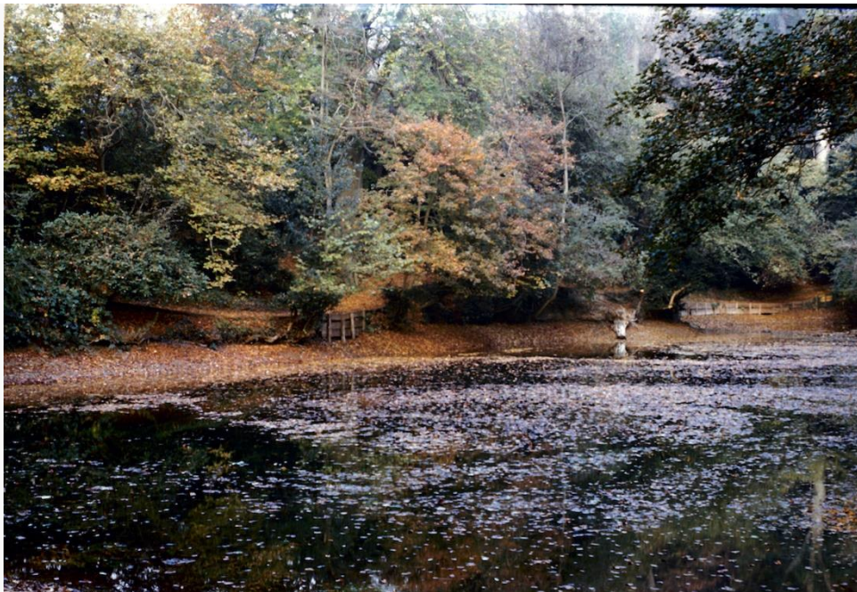
Pictured in 1950, the Silent Pool near Albury.