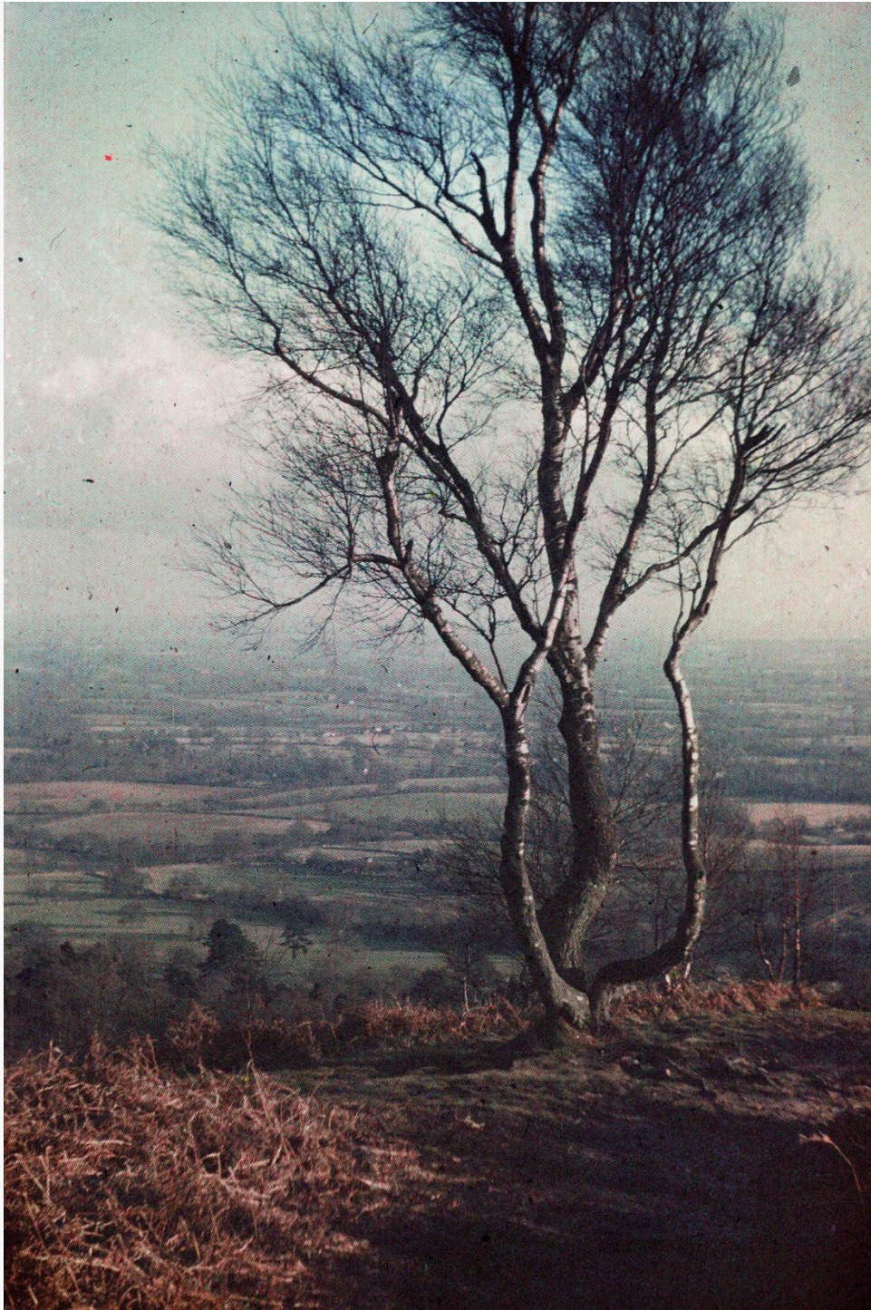
A view from Holmbury Hill, 1952.