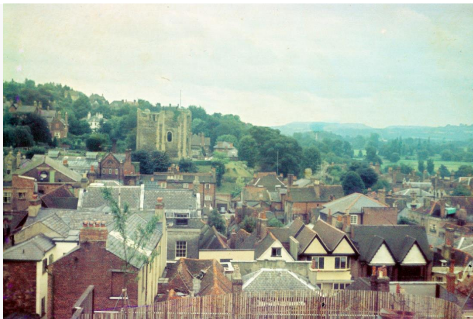
A view over Guildford town centre towards the Castle Keep, taken in 1958 from the roof garden of Harvey's store. Click on all images to enlarge in a new window.