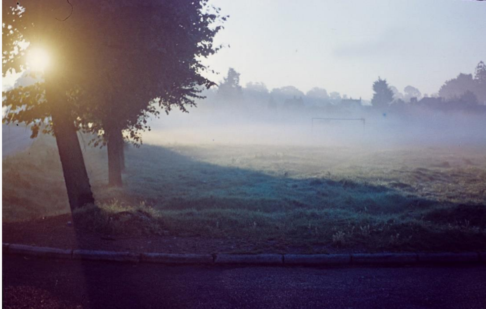
A misty dawn on the common at Shalford from 1956.