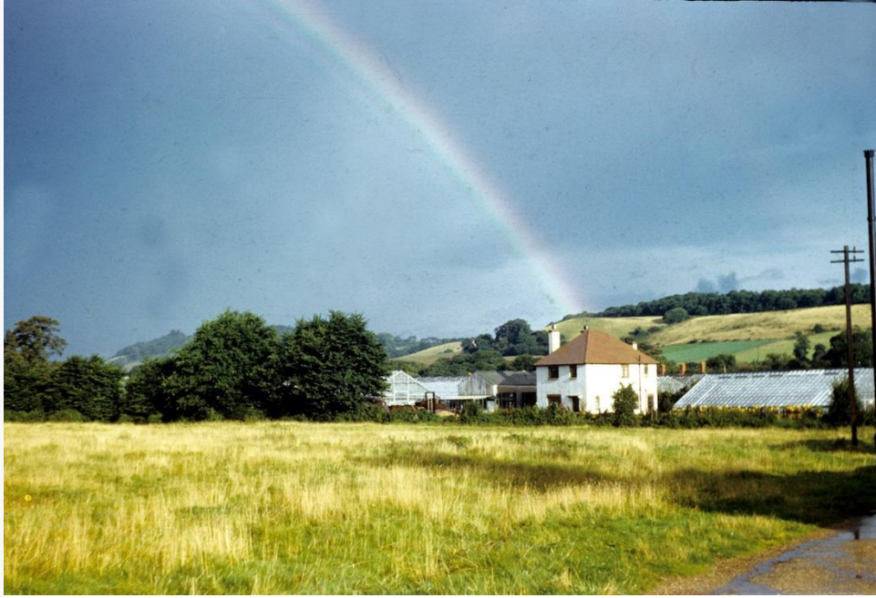
A rainbow Over Shalford in 1951.