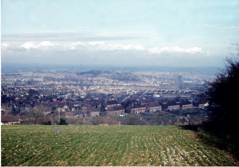
Dating to 1951, this photo, taken from the Hog's Back, looks over Onslow Village in the foreground. Note the telegraph poles and wires.