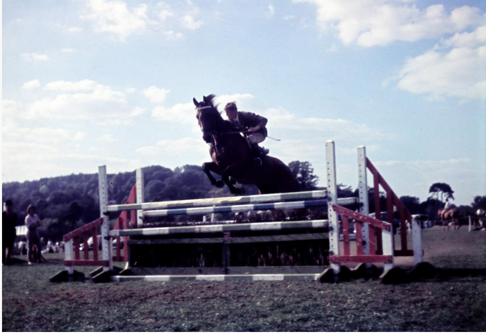
A gymkhana event in Shalford Park in 1959.