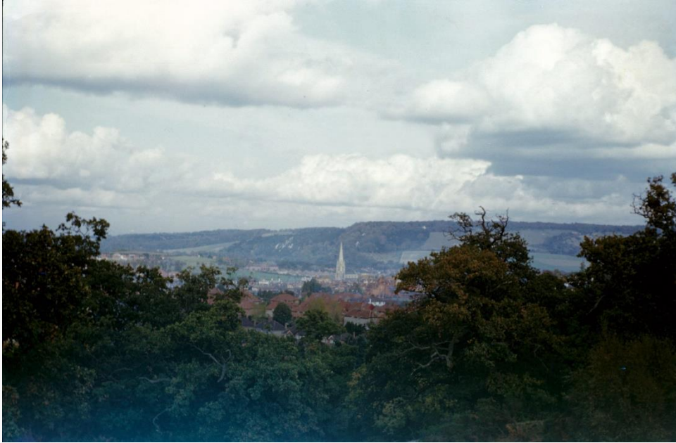
Dorking from the Nower in 1950. In the background is the North Downs.