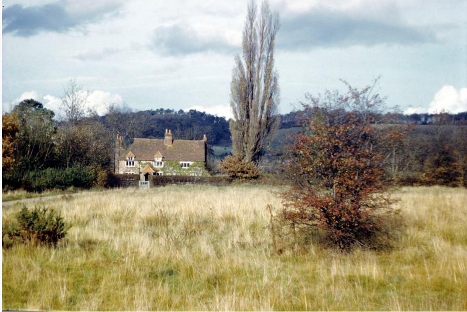
A cottage on the common at Shalford (east side) in 1951. The Chantries are in the background.