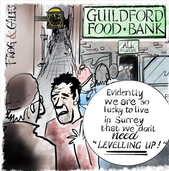
See Dragon story: Surrey 'Taken for Granted' as Government Ignores County in Levelling Up Proposals