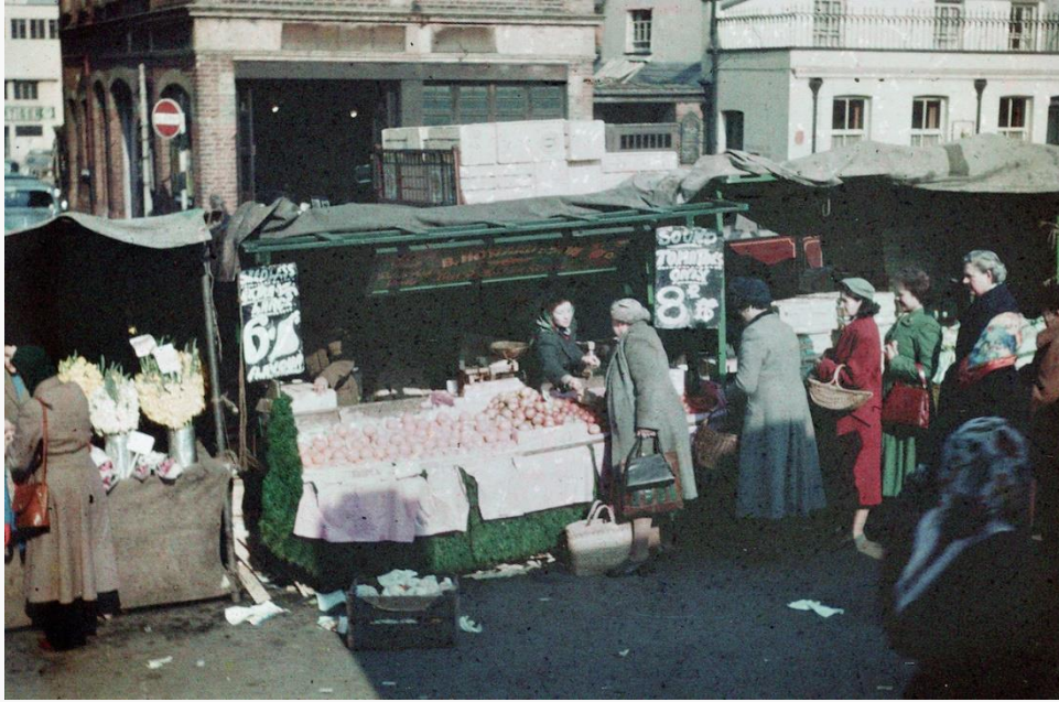
Two photos of the fruit, vegetable and flower market in North Street, taken in 1952.