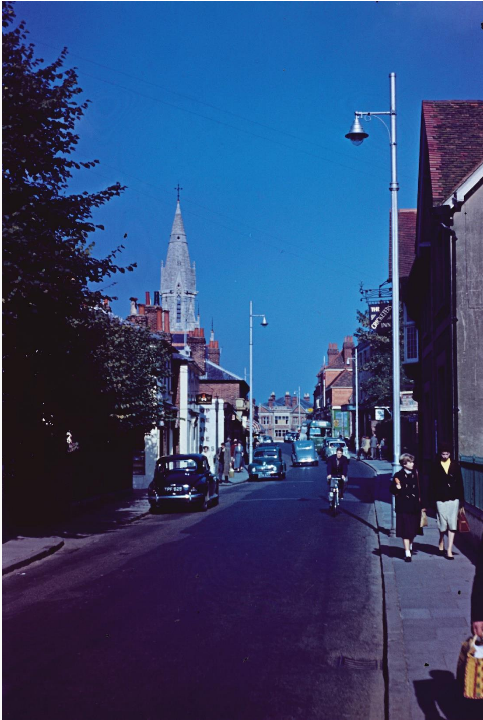
Dorking town centre in 1956.