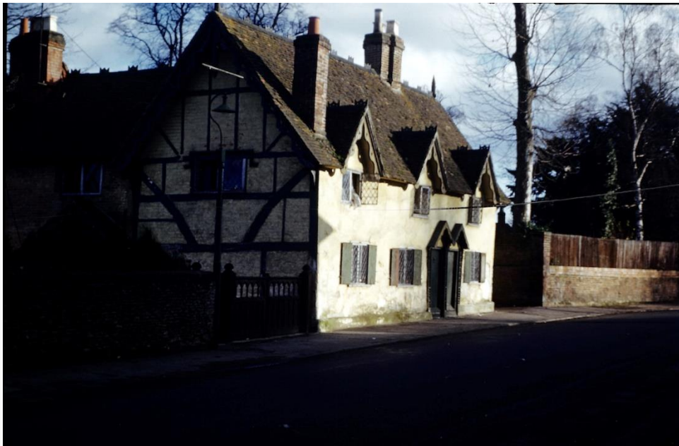
Moving on to Shalford with a series of photos. This one, taken in 1951, features the cottages opposite the Seahorse pub.