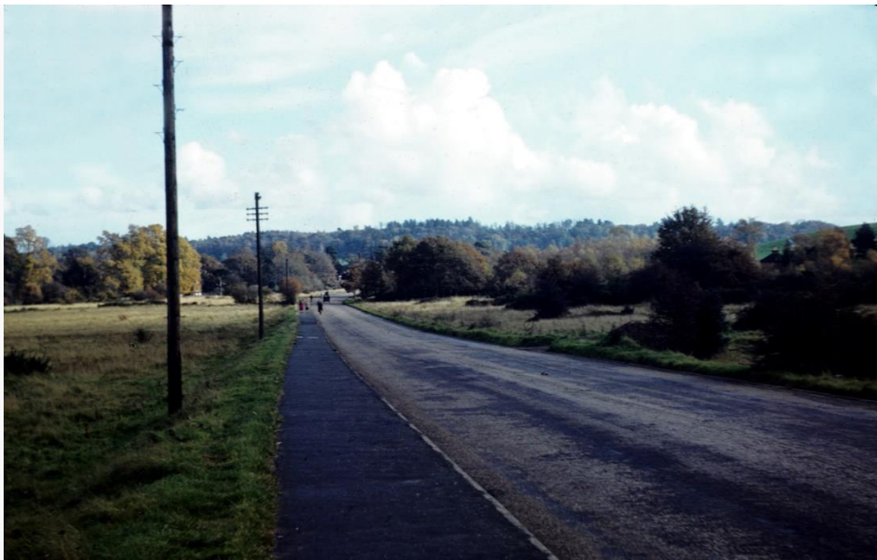
Looking along the A248 towards Chilworth and Wonersh in 1951.