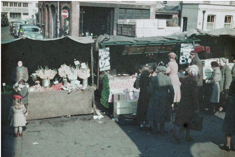
This photo gives a better view looking down Ward Street to the Surrey Advertiser building in Martyr Road.